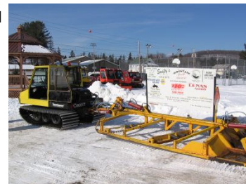
Bombi BR100 w/Sponsor Board

Creek. In addition, D.R.A.G. is working with the Pleasant Riders Snowmobile Club and have formed a joint grooming committee to address all trail issues in the area. We hope for better conditions in 2006 - 2007 but are ready