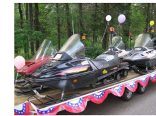
D.R.A.G. Float in 4th of July Parade

D.R.A.G. is not just about grooming trails! Recently we worked with local business members to improve access to the Village via trail LP4. Historically, this trail has been problematic with poor snow coverage and tight turns.